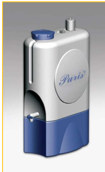
Optional Storage Tank