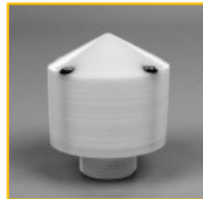
Bottom Steel Plate Distributor