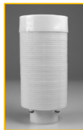
D1199 D1199-04 D1199-02

The Clack top stack distributors, diffusers and baffle diffusers are designed to be used in conjunction with the Clack WS1.5, WS2 and WS2L, the Autotrol Magnum CV™ and the Fleck 2850, 9500, 2900 and 3150 Control Valves. The stack and baffle diffusers are designed to diffuse or break up the inlet water flow when the top stack distributor is not used. The top stack distributors, diffusers and baffle diffusers are designed to accommodate a 1.5", 50mm or 2" PVC riser pipe. Installation is accomplished by simply pinning or screwing in the top stack distributor and diffuser or snapping the top baffle diffuser directly inside the control valve.