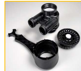
1190FP In-Out Head with Fill Port