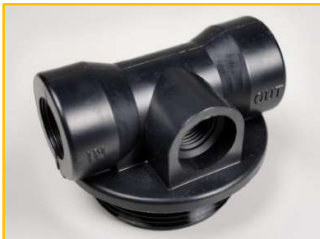
RA201 890 - R7009