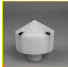
Bottom Steel Plate Distributor