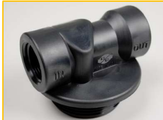
990S - D1226