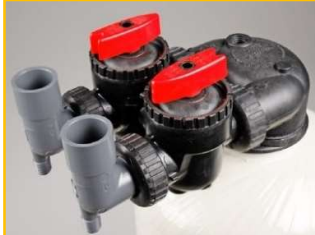
1191 In-Out Head shown optional V3006Bypass Assembly and V3007-01 3/4" x 1" PVC Solvent Elbow Assembly