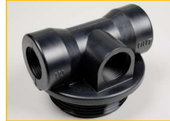
890C - D7173