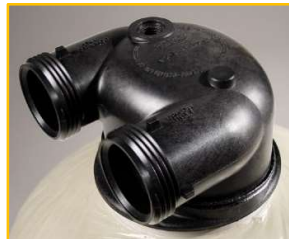
1191 In-Out Head - D1400