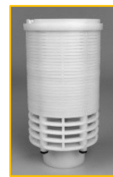
For Flange Tanks D1227