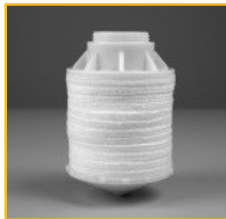
Bottom Felt Distributor