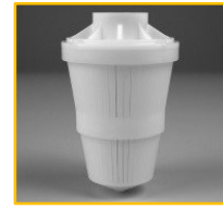
D1236 D1237 D1238