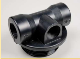
890S - D7171