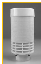
For Flange Tanks D1201-01 D1200-02 D1200-03