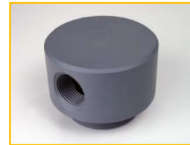
900M - D1221