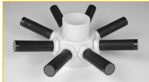
Top Mount Hub and Lateral Series